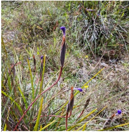
Purple Flag ( Patersonia sericea )