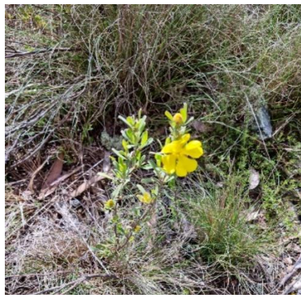
Hoary Guinea Flower ( Hibbertia obtusifolia )