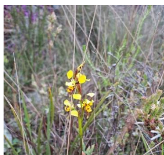
Tiger Orchid ( Diuris sulphurea )