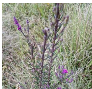
Heath Milkwort ( Comesperma ericinum )